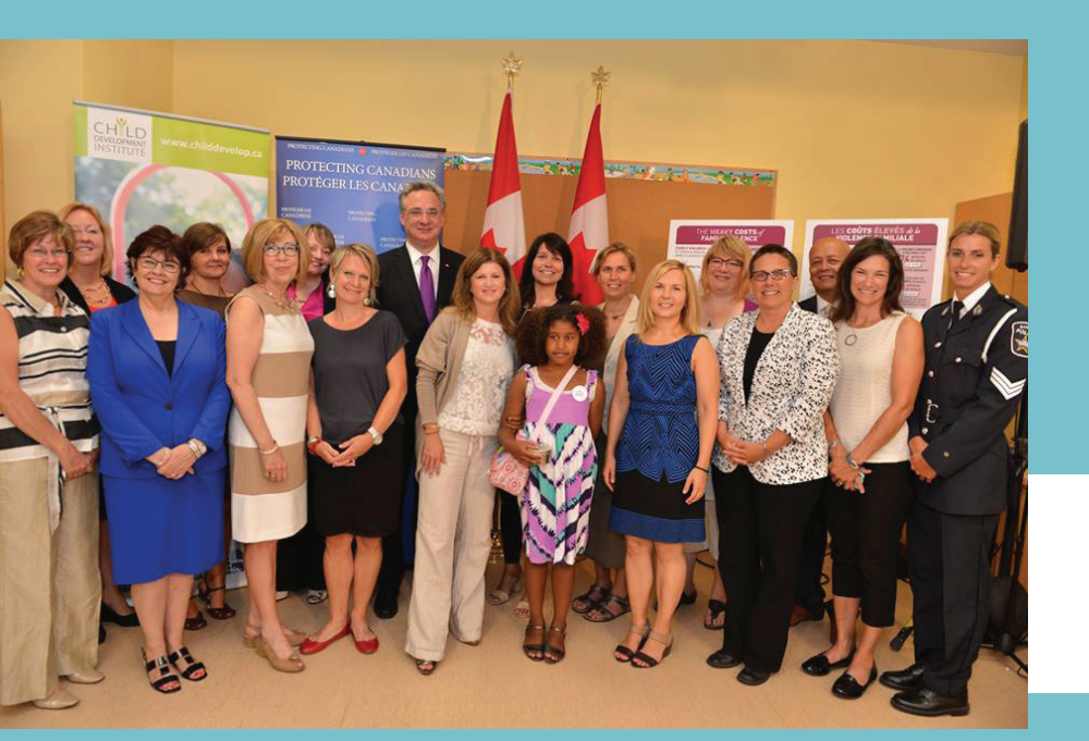
Announcement of funding of projects through the "Supporting the Health of Victims of Domestic Violence and Child Abuse through Community Programs"

Child Development Institute, Toronto, ON