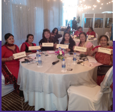
Participatory Action Research Workshop in Deli with women from the International Transport Workers Federation