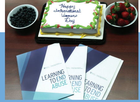
Cake for International Women's Day