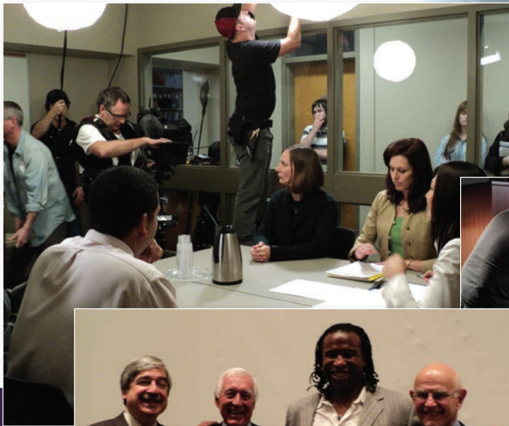
^ Risk assessment and risk management scenario development