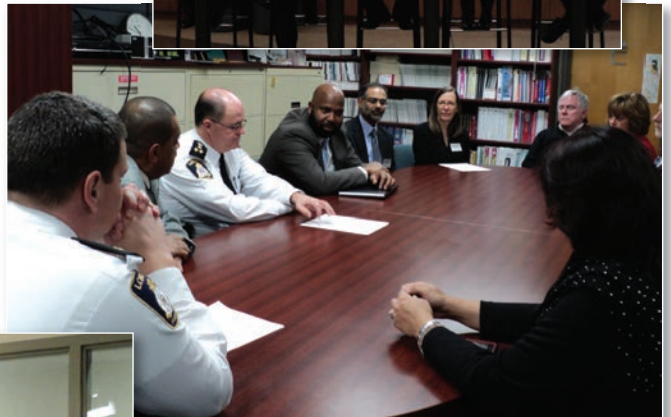
^ Community dialogue on honour killing