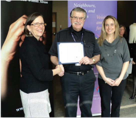
^ NFF Workplace Champions Award Ceremony

> Press conference for Muslim Resource Centre for Social Support and Integration