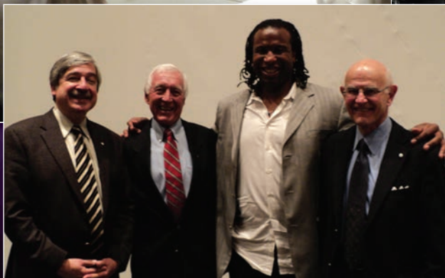
^ "When Violence Becomes Entertaining" conference