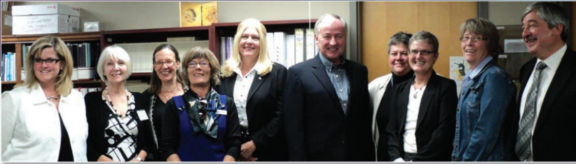
The Centre for Research & Education on Violence against Women & Children hosted a meeting with the Honourable Robert Nicholson, Minister of Justice and Attorney General of Canada; and Susan Truppe, Member of Parliament, London North Centre